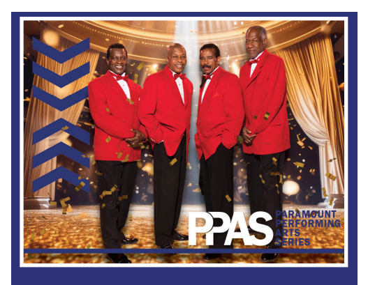
THE COASTERS SAT., FEB. 8 AT 7:30PM

For tickets and more information, visit goldsboroparamount.com/ppas/