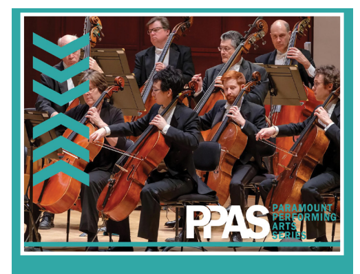
NC SYMPHONY TUE., NOV. 26 AT 8 PM