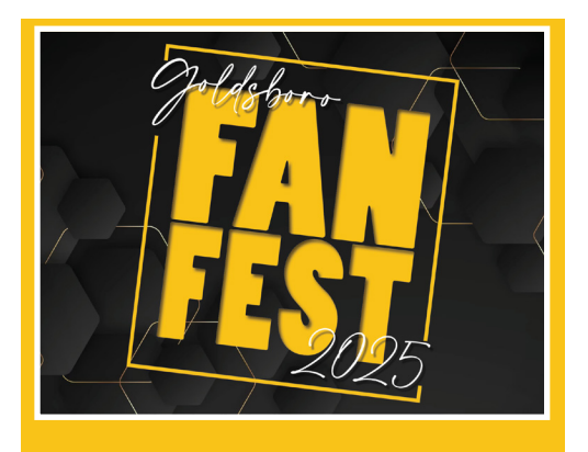
GOLDSBORO FAN FEST SAT., FEB. 22 FROM 12-8PM