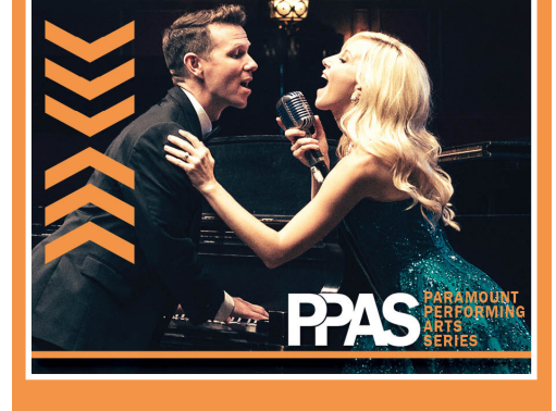
BROADWAY IN LOVE THU., FEB. 13 AT 7:30PM