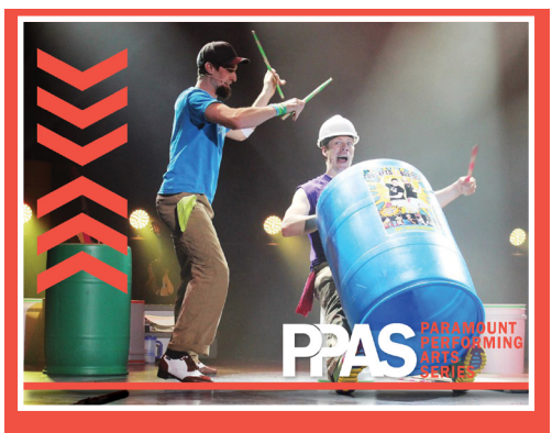
BUCKETS N BOARDS FRI., MAR. 28 AT 7:30PM